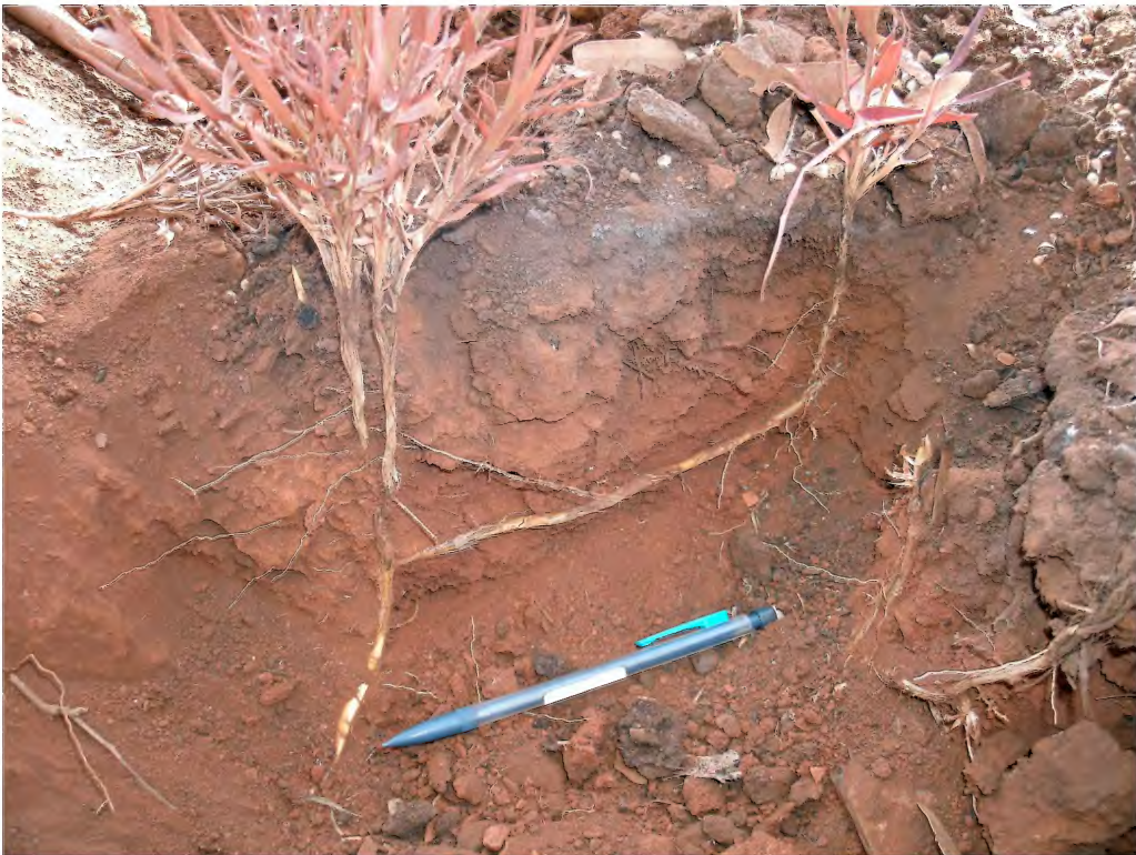
Fig. 8. Eulalia simonii . Elongated rhizomes and clusters of culms of plants, c. 70 km NW of Wittenoom. See Fig. 7 for habitat photo from the same location.